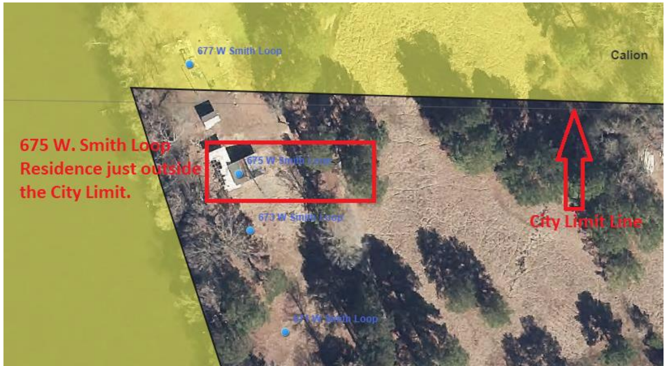
Figure 3. Showing 675 W. Smith Loop just outside the city limit.

Similarly, Staff researched 607 E. Smith Loop. A voter registration record was located and auditor reviewed aerial images of the address. Again, the address was correctly precincted outside the city and given a rural listing on the voter registration entry. See Figures 4 and 5 below.