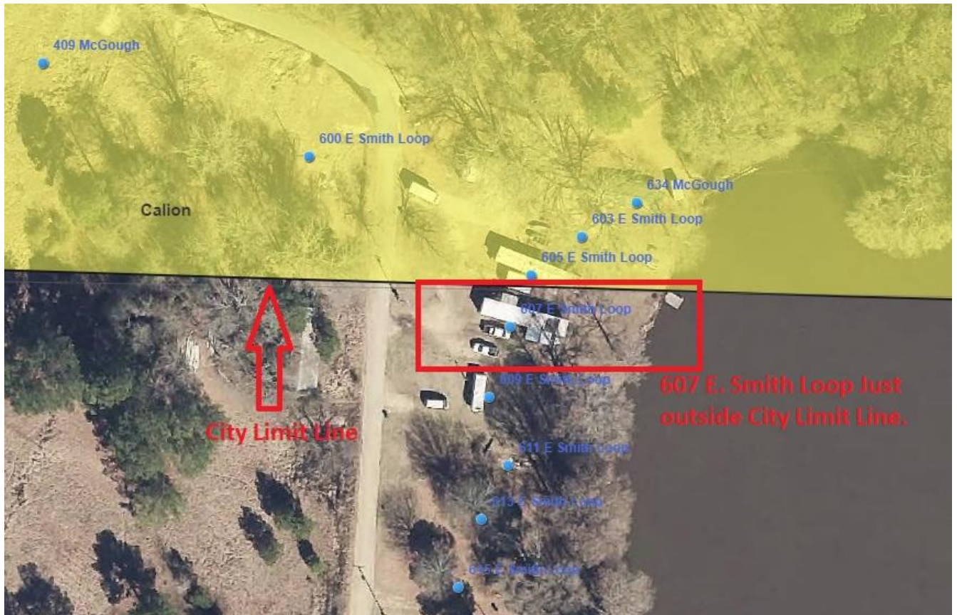
Figure 5. Aerial view showing residence of 607 E. Smith Loop just outside the city limits.

Lastly, Staff located a voter registration record for 405 McGough, an address on the adjoining road to West and East Smith Loop. This record reflected an in-city precinct assignment. See Figures 6 and 7 below.